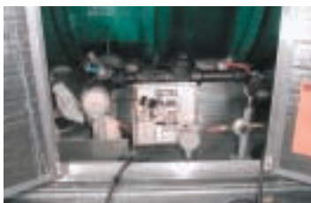
Easily accessible inlet and discharge piping.

Meets G-55 regulatory guidelines for safe containment